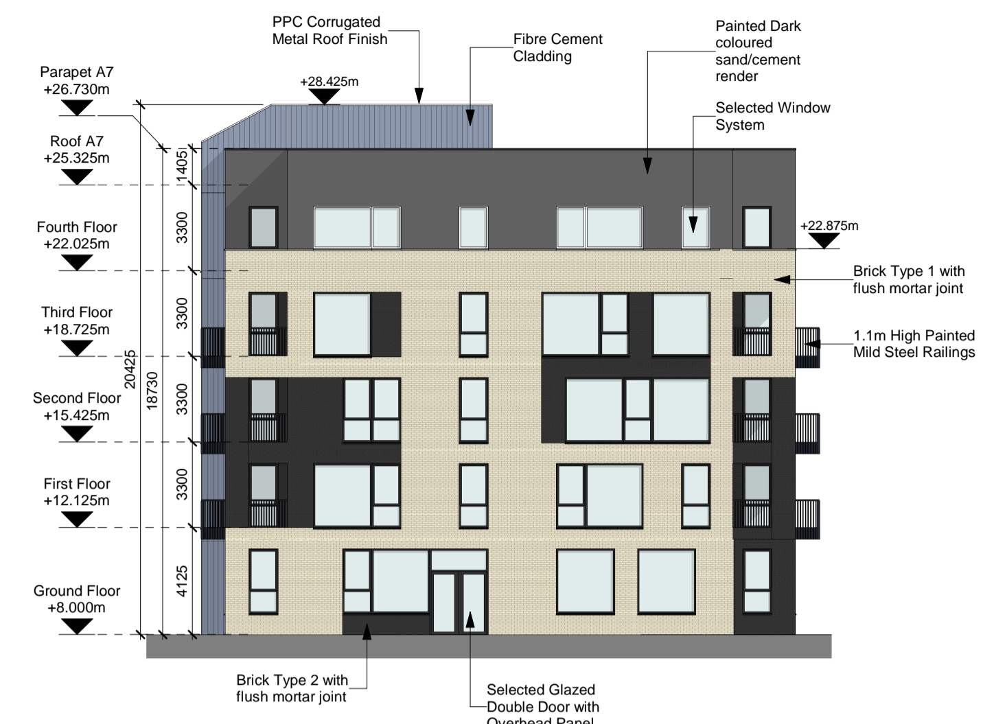
3 South Elevation 1 : 200