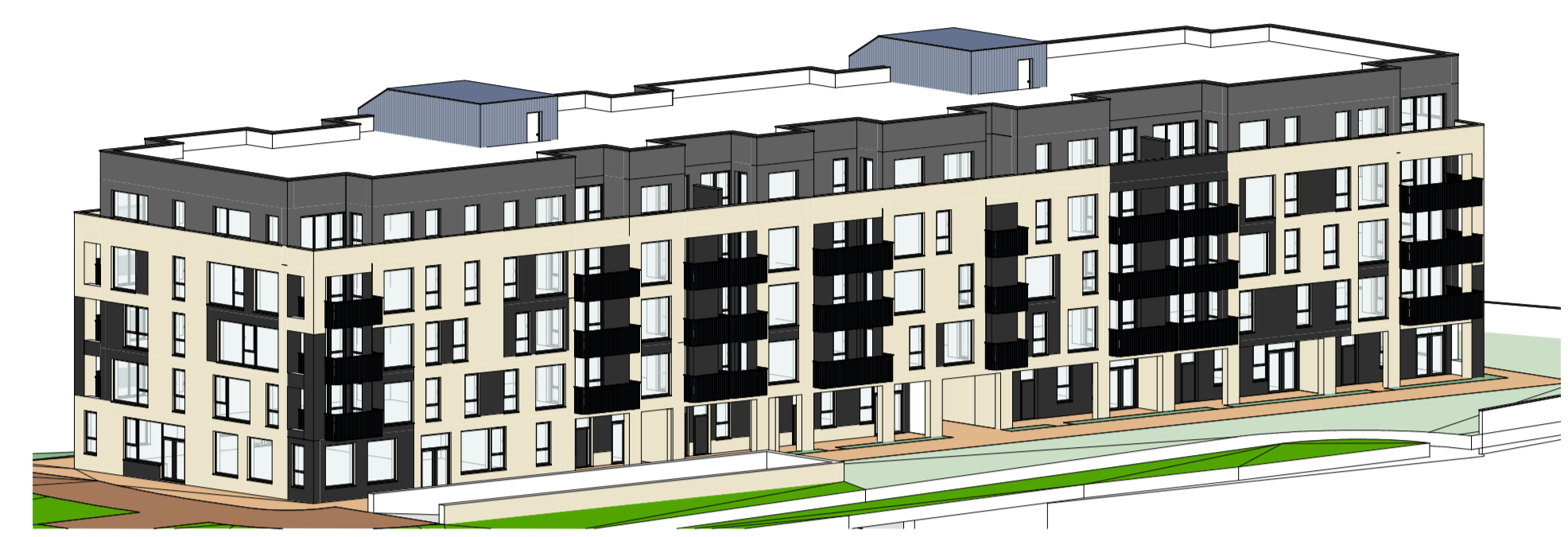
5 3D View of Building