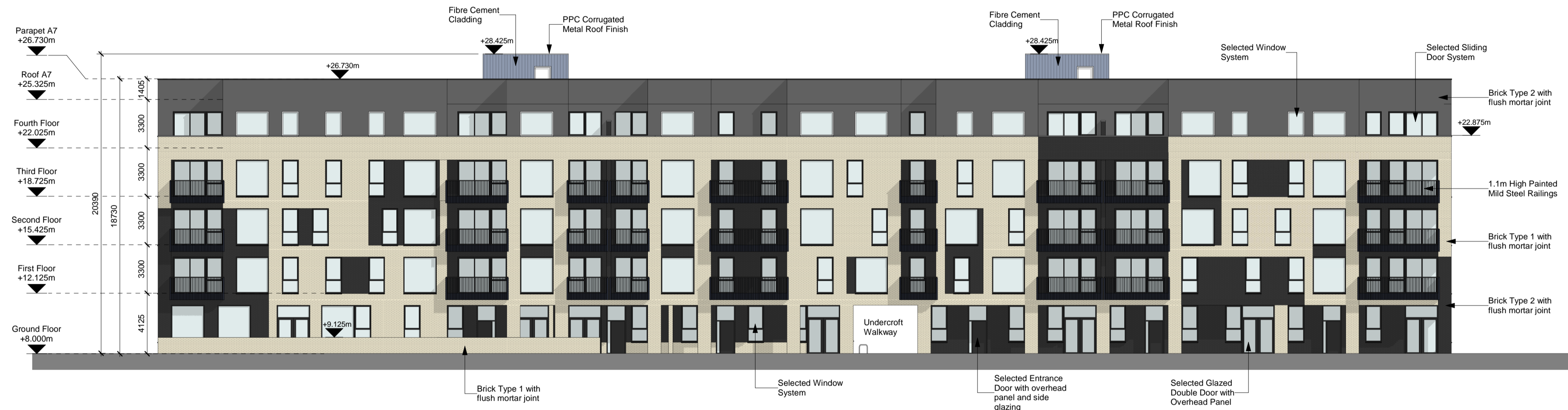
2 East Elevation 1 : 200