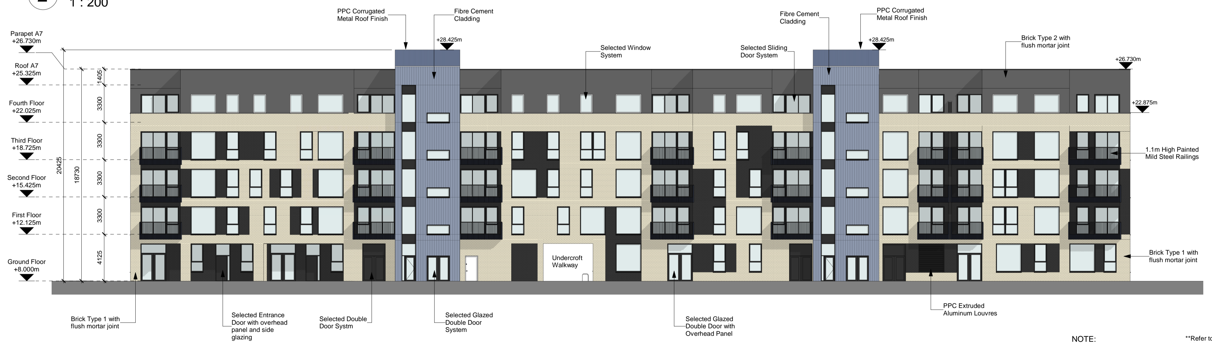
4 West Elevation 1 : 200

NOTE: Refer to Architect's Design Statement for selected material & finishes on buildings.